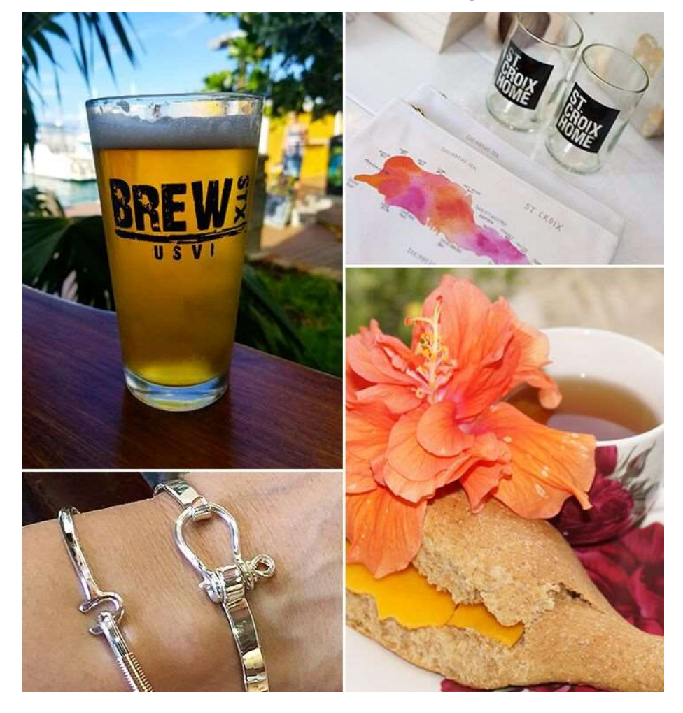
Day 6: Foodie Favorites and Downtown Shopping

Start your visit to the island's western side with a journey into St. Croix's complex past at the <u>Estate Whim Museum</u>. This 18th-century plantation and sugar mill is the oldest of its kind in the Virgin Islands and was once home to acres of sugarcane fields. The museum's exhibits tell the story of the African slaves who lived and worked there, as well as the sugar industry that ruled the Caribbean during this time period. Continue your exploration by heading to the picturesque town of Frederiksted, which is seven streets long by seven streets wide. This tiny town is chock-full of colorful, historic buildings like the Customs House and Fort Frederik. End the evening with a sunset or moonlight cruise with <u>Lyric Sails</u>. Aboard the Jolly Mon , the live band and bottomless rum punch will definitely make for smooth sailing.