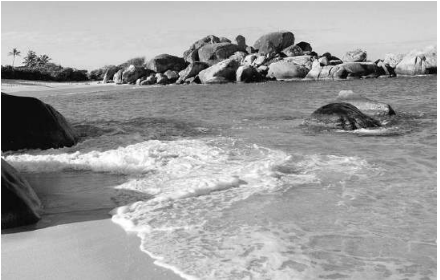
Pelican Beach, St. Croix

The local mostly Afro-Caribbean population relies on an economy dominated by tourism with minor input from the rum industry and farming.