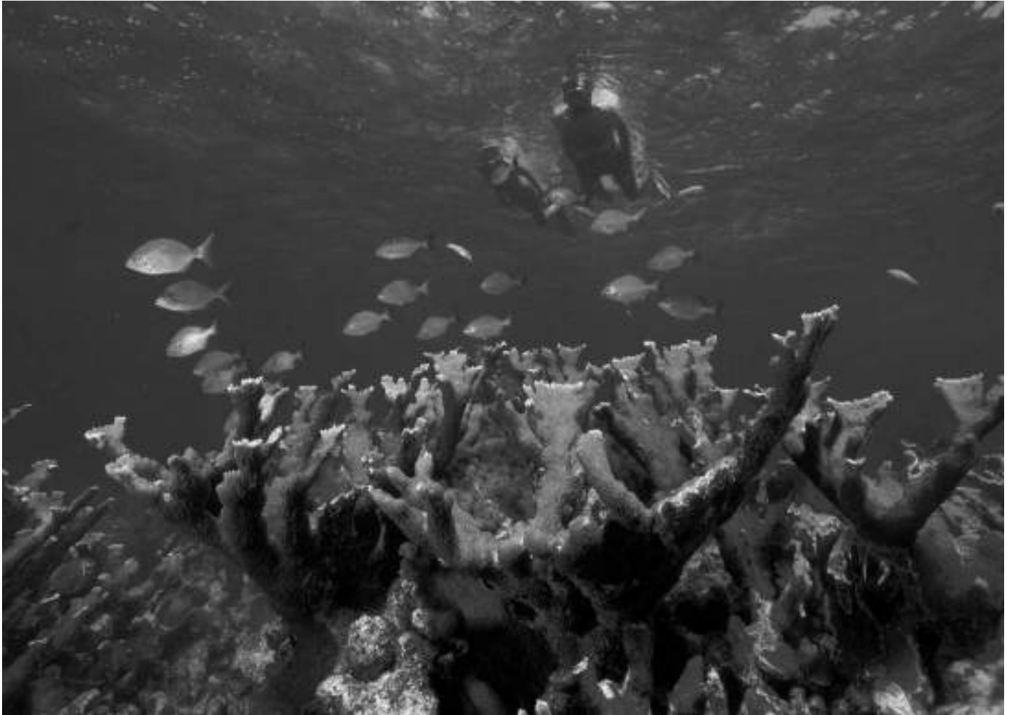
Eagle Shoals, St. John, US Virgin Islands