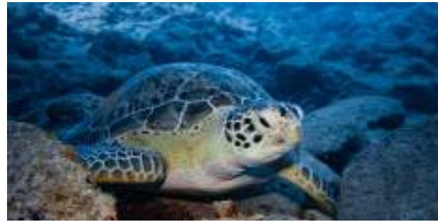
📍 Green Sea Turtle