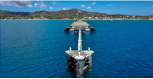
📍 The Three Amigos