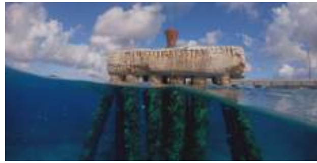
📍 Mooring Dolphin