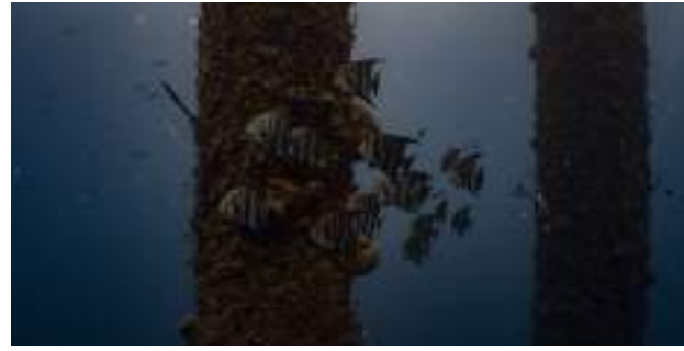
Atlantic Spadefish at The Three Amigos

angelfish, and queen angelfish. At night both spotted and spiny lobster can be found freely walking around the additional concrete rubble that lies around the dolphins.