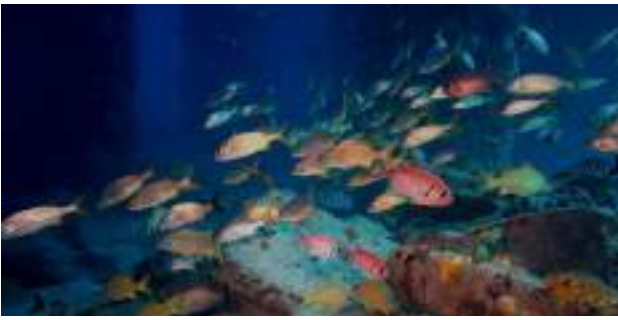
📍 Grunts and Squirrelfish