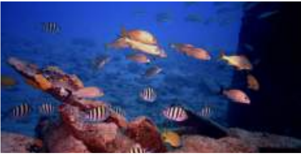
📍 Sergeant Majors and Grunts