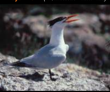
Royal Tern (Thalasseus maximus)

Large white tern with orange bill and a short, forked tail. Black crest on back of head except during breeding season. In USVI, lay 1 large, spotted egg in nest in low grass or sand, usually with sandwich terns. Young créche like sandwich tern young. Breeds May to July. Breeds April to July. Nests on Dog, Turtledove, and Pelican Cays, sometimes on Flat Cay and Little Hans Lollick.