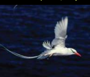
Red-billed Tropicbird, Buoy Bird (Phaethon aethereus)

White with 2 very long tail feathers, bright red bill, black barring on the back, black line across each eye, and a black band across back of neck. Lays 1 purplish-brown egg on the ground in rocky crevices or under dense vegetation. Breeds October to May. Nests on Cockroach, Dutchcap, Kalkun, Inner Brass, Hans Lollick, Congo, Mingo, Grass, Carval Rock, and other small cays with suitable habitat.