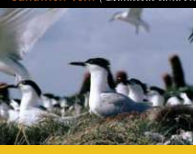
Sandwich Tern (Thalasseus sandvicensis)

Medium-sized white bird with very pale-gray plumage, black legs and feet. Black bill with yellow tip, but some individuals have dull yellow bills. Black scruffy crest during the breeding season. Chicks form tight groups called créches. Lays 1 spotted egg in dense colonies. Nests on Dog, Turtledove, and Pelican Cays. Sometimes on Flat Cay and Little Hans Lollick.