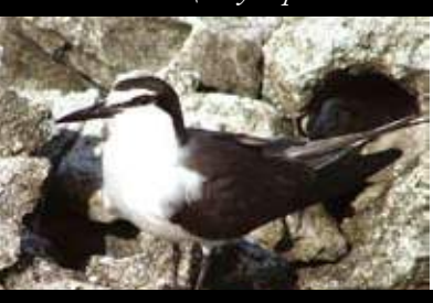
Bridled Tern (Onychoprion anaethetus)

Dark grayish-brown plumage above and white below with white collar and forehead, and black cap. Nests in small groups, mostly under vegetation or under rocks. Breeds May to July. Nests on Dog, Flanagan and Saba Islands, Turtledove, Flat, Frenchcap, Cricket, and Kalkun Cays, and Carval and Booby Rocks