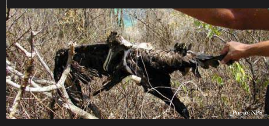
Magnificent Frigatebird Caught in fishing line