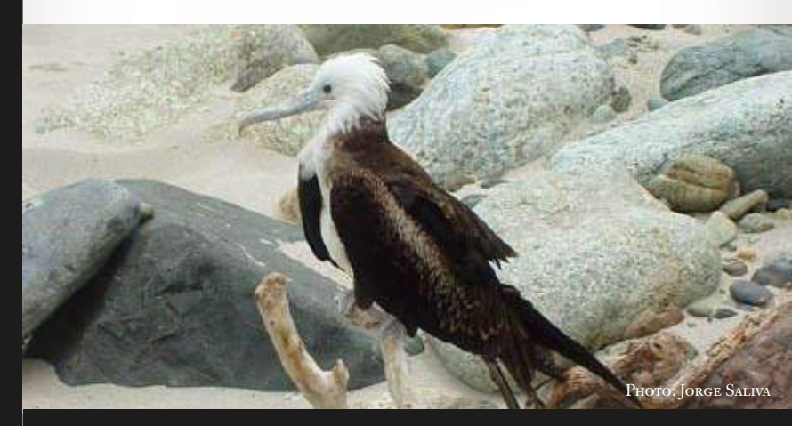
JUVENILE MAGNIFICENT FRIGATEBIRD

IF YOU ENCOUNTER A HOOKED SEABIRD THAT CANNOT BE CAUGHT WITHOUT COMPROMISING YOUR PERSONAL SAFETY, LEAVE IT, AND PLEASE CALL THE DIVISION OF FISH AND WILDLIFE (ST THOMAS) AT 340-775-6762 OR (ST CROIX) 340-772-1955.