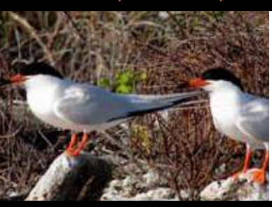
Roseate Tern, Pilinki bird, Bonito bird (Sterna dougallii)

Small white bird with a long forked tail, pale gray plumage and red legs. While breeding, it has a black cap and black bill with red at its base. Usually nests in large colonies in rock depressions or under vegetation. Breeds May to July. Preferred islands for nesting: Shark, Kalkun, Flanagan, Leduck, Saba, Flat, Pelican, Rata, Two Brothers.