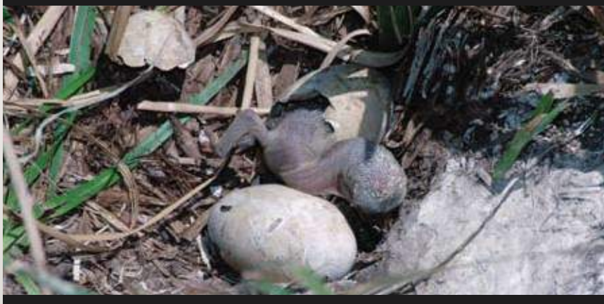
Brown Booby Chick in nest Brown Pelican in breeding plumage forages for fish