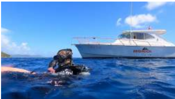
Dive day with Red Hook Dive Center on the East End of St. Thomas

As one of the most popular cruise ports in the world and the top Caribbean destination for Americans, you won't find any shortage of dive operators on St. Thomas.