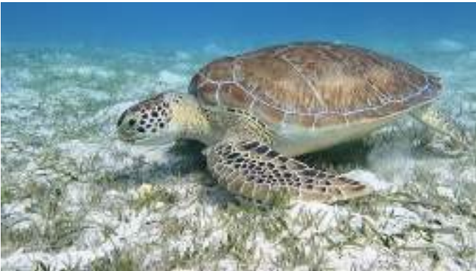
Green sea turtles are a common sight while diving in the Virgin Islands

As with anywhere ( even the worst places ), there are always more reasons TO dive somewhere than to not dive. The same holds particularly true for St. Thomas.